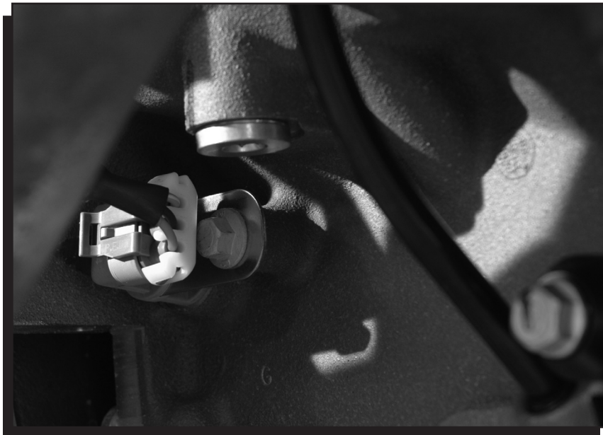
Figure 3 Crank Trigger Sensor Location.

The Crank Trigger Sensor is located on the rear passenger side of the block, just above the starter (Figure 3).